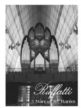
Fratelli Ruffatti Pipe Organs Padua, Italy

New 4 Manual Console to be interfaced with 45 Rank Casavant Pipe Organ at Sligo Seventh Day Adventist Church Takoma Park, Maryland