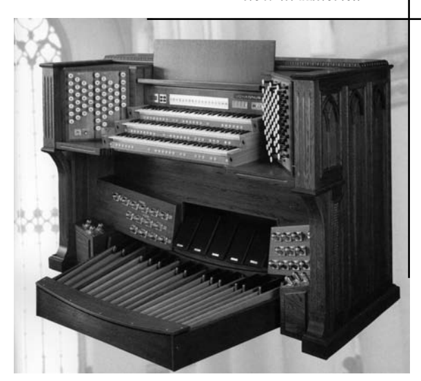
American Classic V 80 Voices, 5 Divisions, Floating Solo

European quality and design now in America